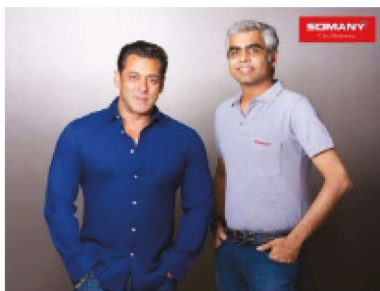
showcase Somany's humble and rooted Judey'.