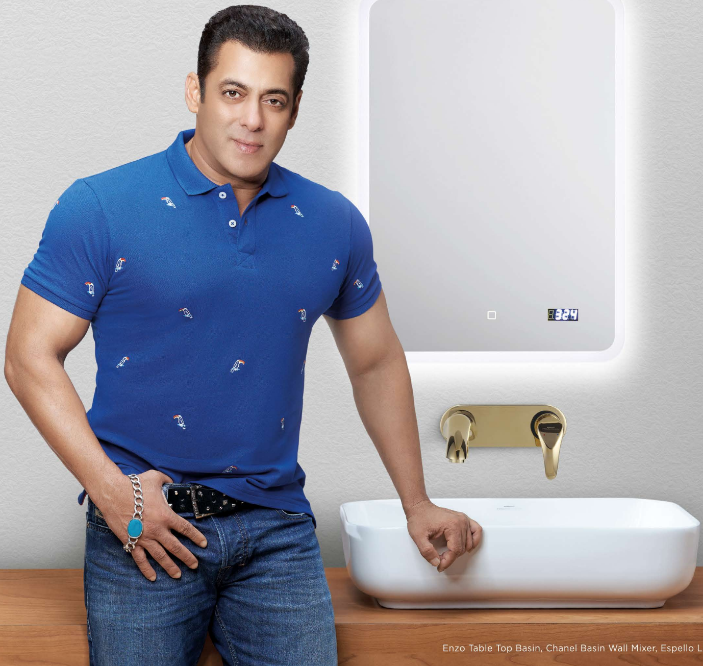
Enzo Table Top Basin, Chanel Basin Wall Mixer, Espello LED Mirror

A range of bathware from Somany, so stylish that you now get to pick what superstars do.